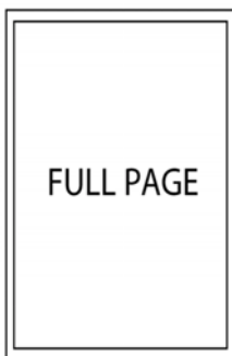
FULL PAGE Trim 5.5" x 8.5" Safety 5" x 8" Full Bleed 5.75" x 8.75" (includes 1/8" bleed)