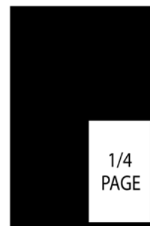
QUARTER PAGE Trim 2.4375" x 3.9375"